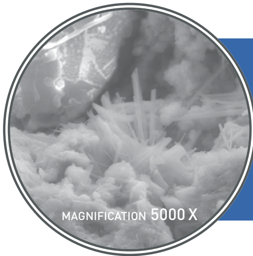
MAGNIFICATION 5000 X

The active ingredients in PENETRON ADMIX react in a catalytic reaction with moisture in fresh concrete and by-products of cement hydration. This chemical reaction generates a non-soluble crystalline formation throughout the pores and capillary tracts of the concrete that permanently seals microcracks, pores and capillaries against the penetration of water or liquids from any direction. This protects concrete from deterioration, even under harsh environmental conditions.